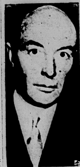
President Truman appointed Robert A. Lovett, New York banker and former assistant secretary of war to replace Dean Acheson as undersecretary of state after Acheson resigned Monday.