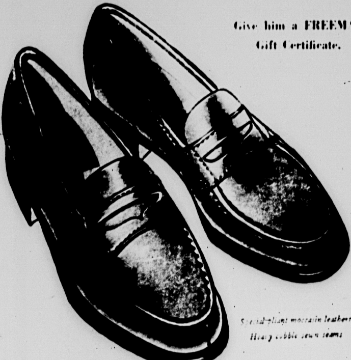
Super-pliant moccasin leather Heavy cobbie sewn soles

For the loafin' you love best - enjoy the luxurious comfort of this handsome moccasin... so easy it will double for house slippers indoors, yet it's built to take just about the roughest outdoor assignments you can dream up for your leisure hours.