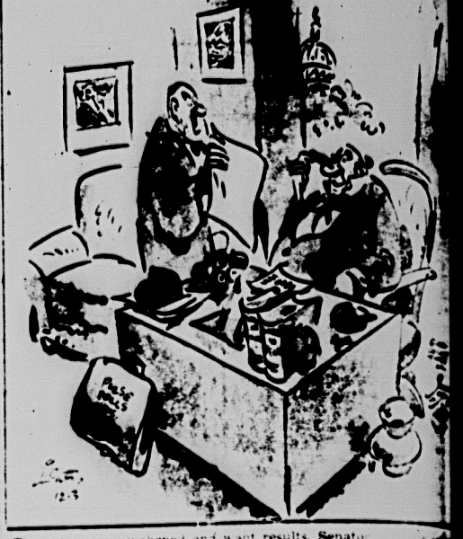
The voters are awakened and want results. Senator shows that 20% of those who voted for you last month show your name!