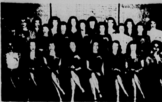
One of the above women will be chosen queen to reign over the "Yuletide Aquacade" this weekend. Four of the others will reign as her court.

Porpoise Queen, Court Will Rule 'Yuletide Aquacade'