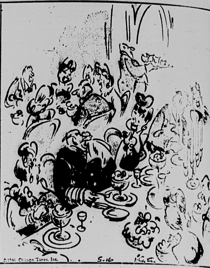
© 1945 Chicago Times, Inc. 5-16

"Are you taking part in the atomic bomb thing? Or is it only the ships they're using that are..."