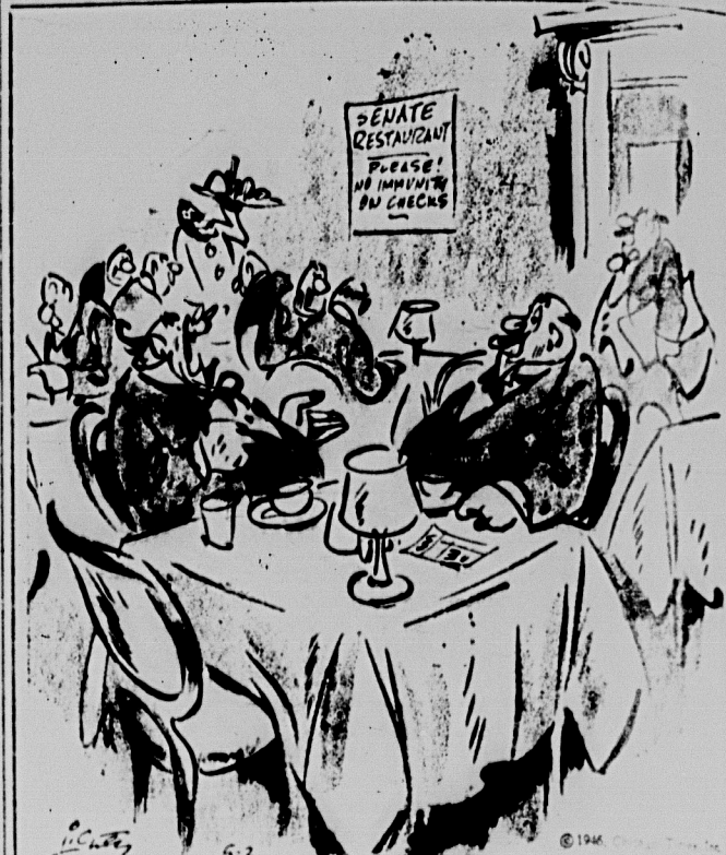
"This will be a difficult campaign—I can't think to promise my constituents that they aren't already..."