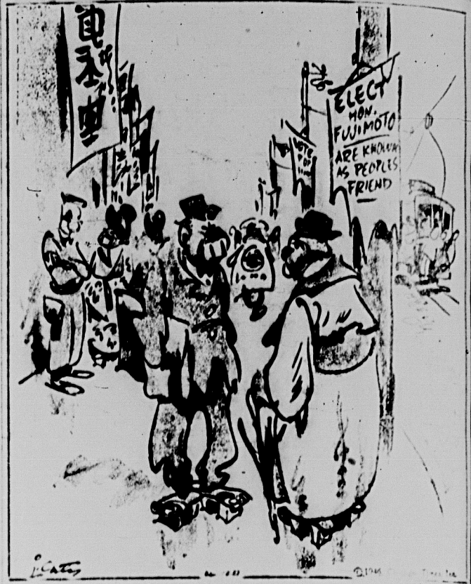
"Our election very old fashion—hear U. S. type automatic—run by Hon. Machine"