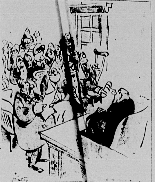
The next case, your honor—the people versus the Boardman Eye Catcher Board Co.