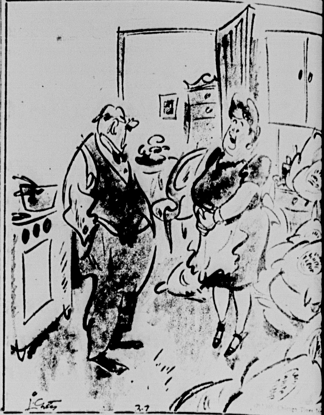
"Okay—if you bought 700 pounds of flour, you bought that's all—but surely ONE of your friends should bake a batch of white bread."