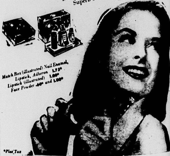
Match Box (illustrated) Nail Enamel, Lipstick, Adhesion 1.75 Lipstick (illustrated) 1.00* Face Powder .40* and 1.00*