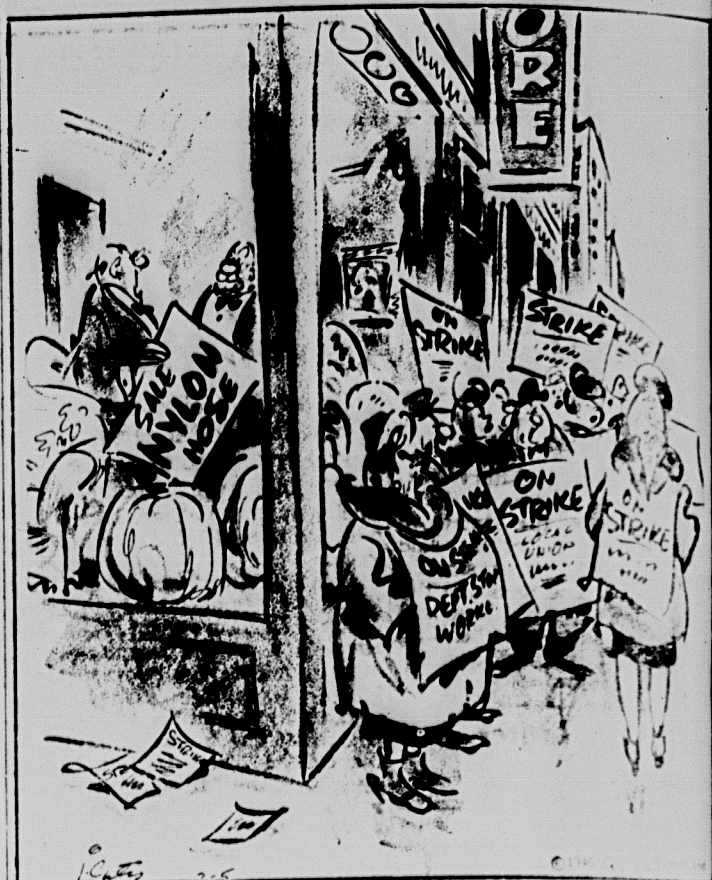
"I admit it'll break up the picket line, Sedgwick—but they're our employes—and the casualties might be..."