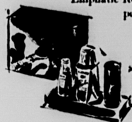
Match Box (illustrated) Nail Enamel, Lipstick, Adhesion 75¢ Lipstick alone 1.00*

Wonderful new pink-gold rose for matching lips and fingertips. Smart Americanism... inspired by the famous Hildegarde... it's as devastating as her famous champagne personality! Emphatic Revlon "stay-on" power... of course!