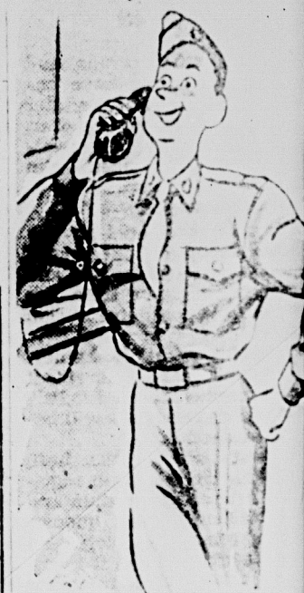
"You'll know her the minute you see her. She'll be that red-headed knock-out in a Jonathan Logan dress."