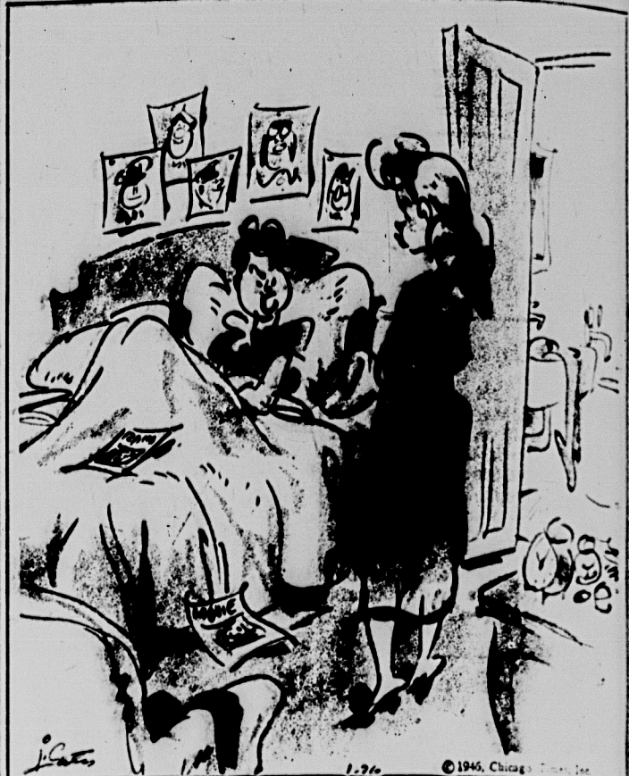
"It's nice they're civilians again—but they just don't have the enthusiasm and reckless abandon they had on 5-day torments."