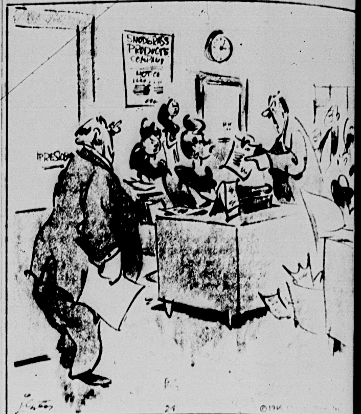
"Come, come, Beasley—Control yourself!—do you want to cause a nationwide sympathy strike in the industry?"