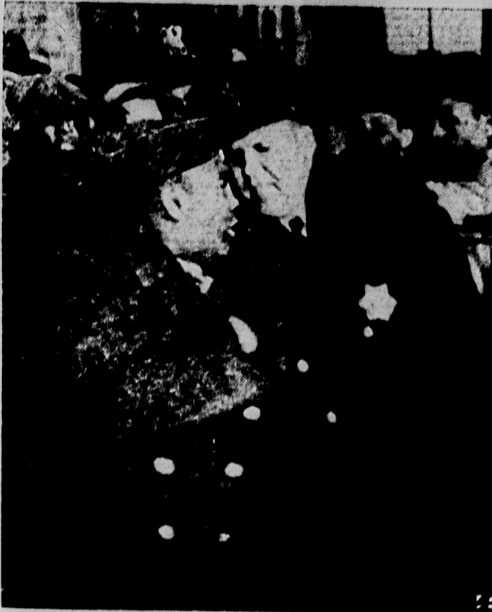
A city policeman bumps into a man in army uniform during a picket line melee in Chicago, which resulted in 13 persons being taken into custody near the Chicago Union stockyards where a packing house employees' strike is in progress.