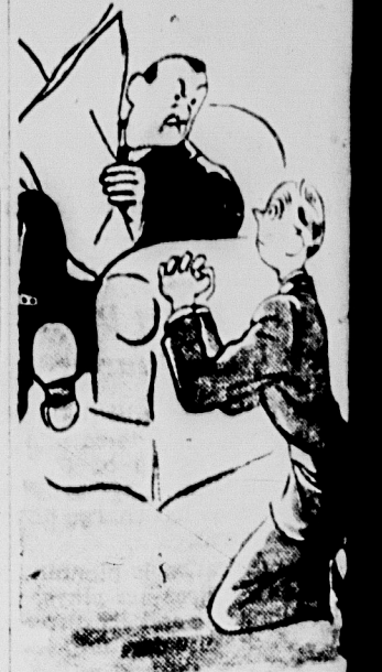
"Can you keep her in the of Jonathan Logan dresses been accustomed to"

BASS AND SAX PLAYERS for nine-piece band. Call 2-2585. 73