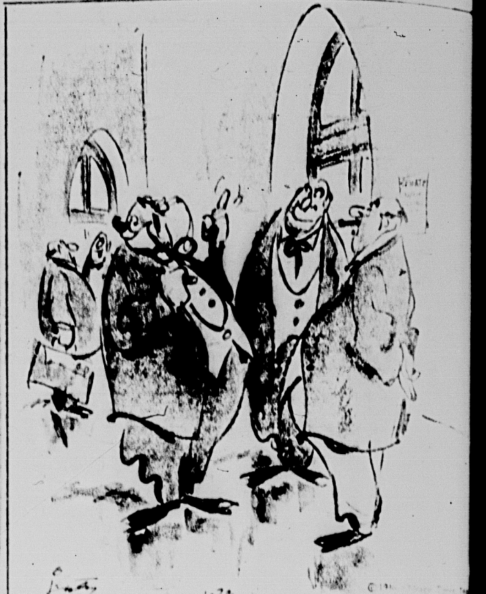
"I resent the charges of being an obstructionist in passing needed legislation" — why, most of the time I wasn't even there.