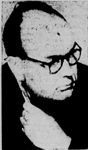
Paul Henri Spaak, Belgian foreign minister, elected president of the United Nations General assembly at its opening session in London, is shown as he presided over the proceedings at Central hall, Westminster.