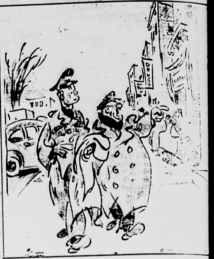
"—And that's where we fought for cigarettes—over there is where your mother battled for meat and there's where the ration board was dug in!"