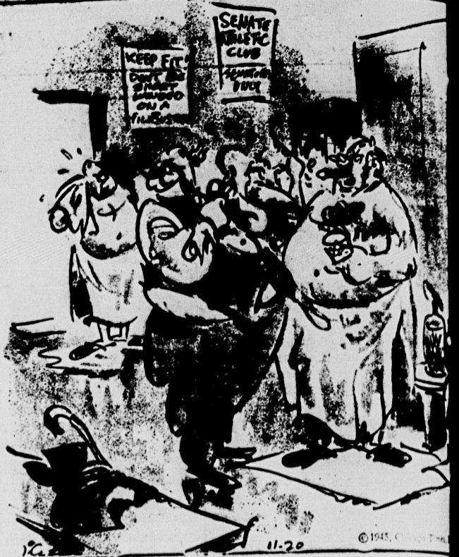
"The public should appreciate us congressmen more—all, we really make mistakes only for future generations profit by!"