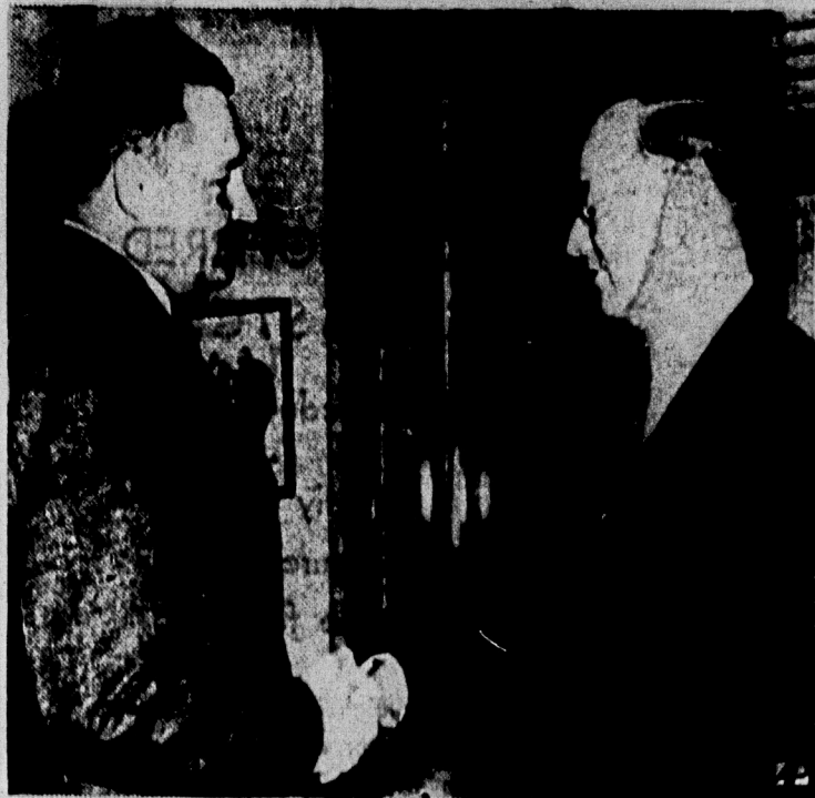
DONALD NELSON (right), ex-chairman of the War Production Board, is pictured in Washington congratulating his successor, JULIUS A. KRUG. Nelson will take a new government position "of major importance."