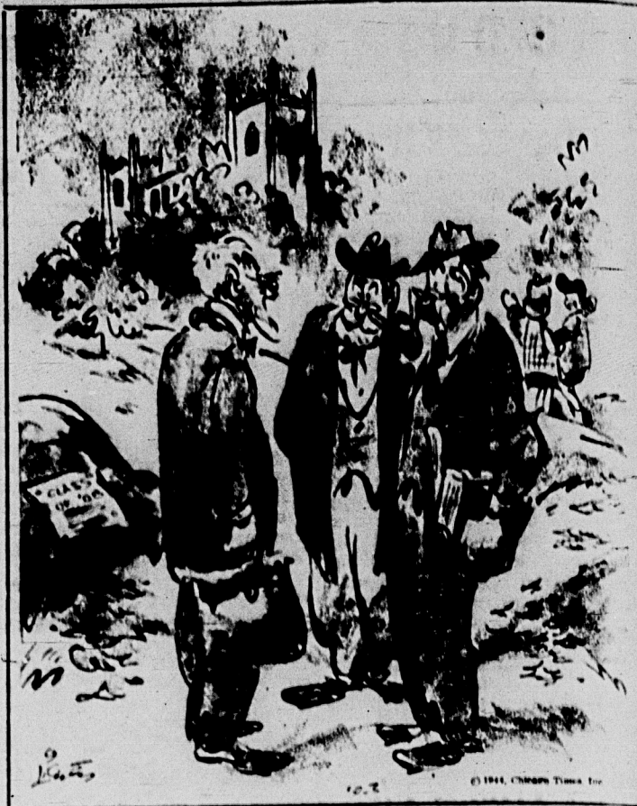
"Frankly, we aren't qualified, as yet, to teach the veterans, who will soon be enrolling and who are accustomed to the straightforward and aggressive methods of drill sergeants."