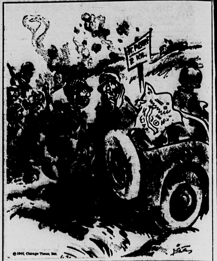
"Ah . . . I think we'll by-pass this next village sergeant . . . it seems I made some mighty tall promises to a gal there back in 1918!"