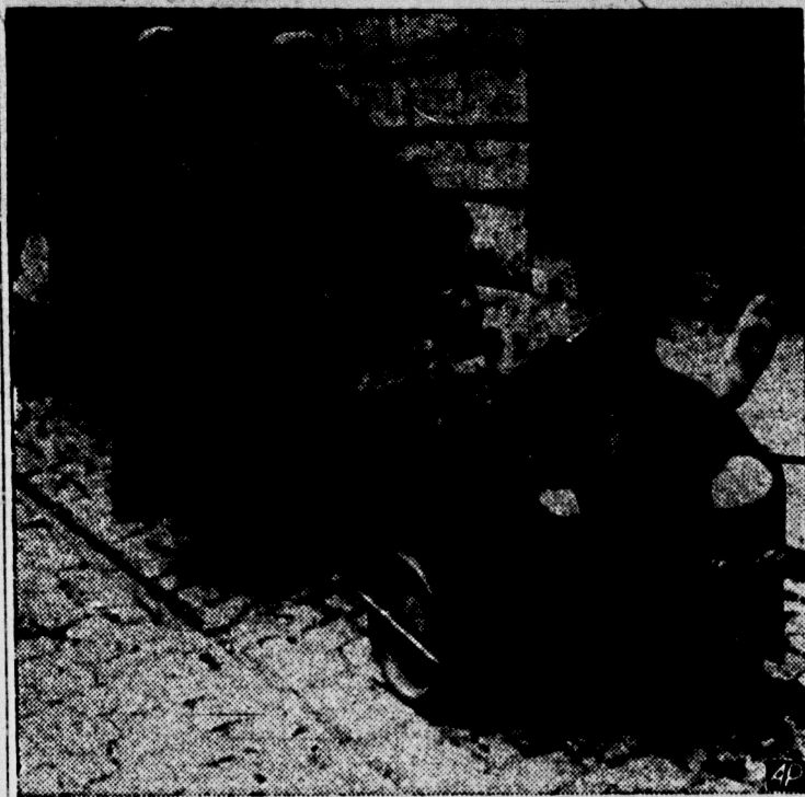
A wounded German soldier, his injured leg propped up in a perambulator towed by two companions, makes his exit from the war in Cherbourg, France. Next stop is an Allied prison camp.