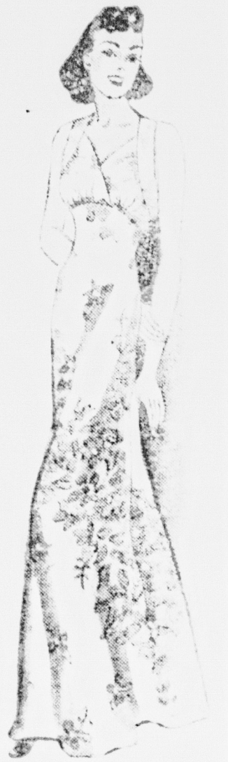
Printed lawn trimmed with lace, 3.00