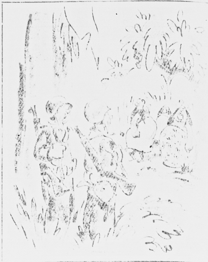
The soldier's grin is a bit of a mystery to one of those.