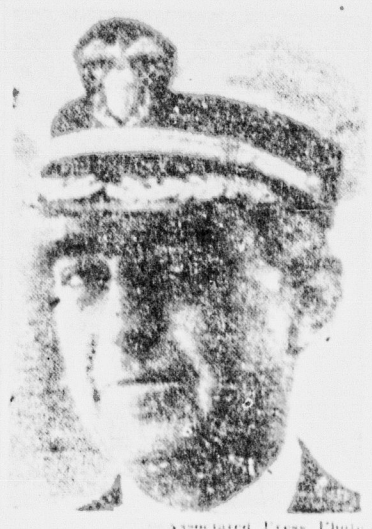
Vice Admiral THOMAS KINKAID , commander of the Navy's 1st fleet, is shown in a portrait. He is wearing a naval officer's uniform and a cap. The caption identifies him as the new commander of the 1st fleet.

This extended "field trip" is the culmination of work taken the first half of the term in three education courses: com-