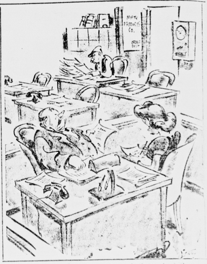
And with most of our personnel gone back to school, be a slight delay in filling your orders."