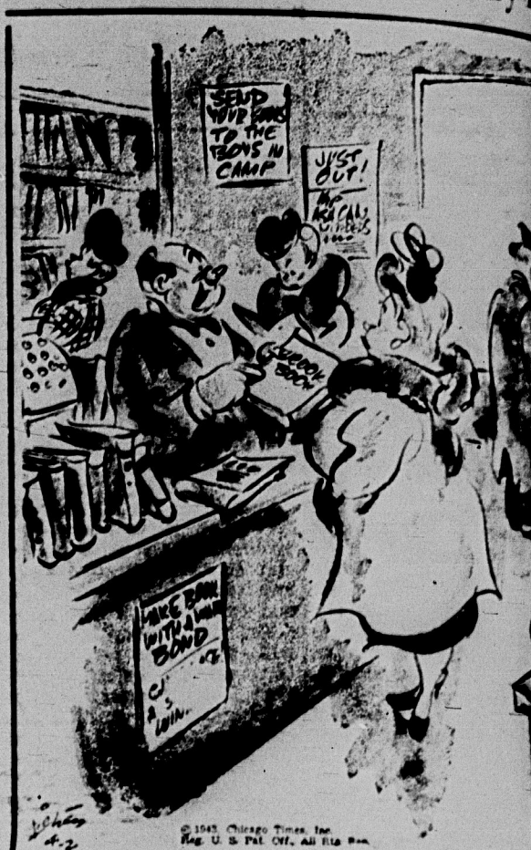
"For some good 'escape' literature + might suggest pre-war cook book."