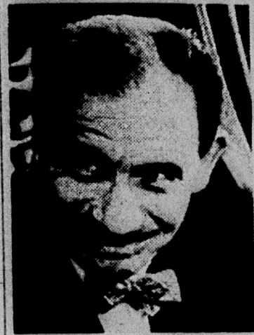
F. P. ADAMS