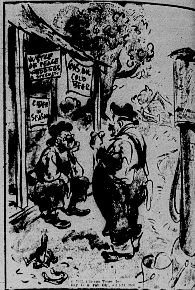
"War's shot my business, too, Lem! Used to make a livin' pullin' cars outa that mud hole in front of my place."