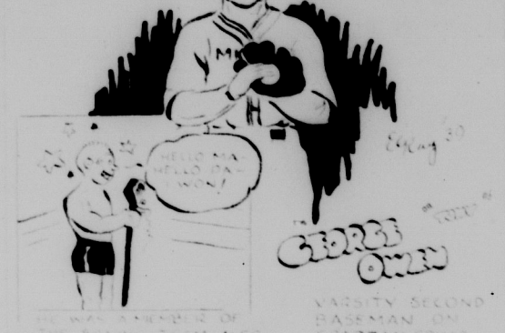
THE WARRIOR OF THE SECOND TEAM ALSO.