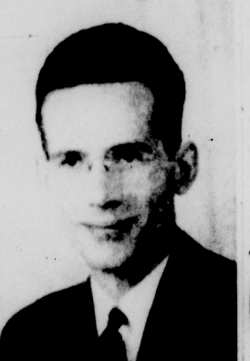
ART DE CAMP