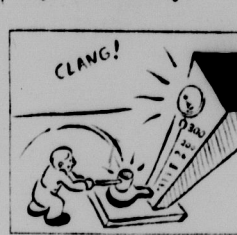
HE HAS BATTED .300 SO FAR THIS YEAR.