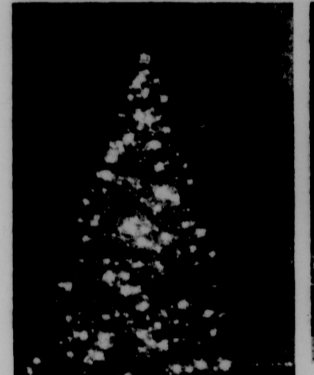
Manger at the college entrance (above) was erected by local merchants. The college Christmas tree (left) lights up for the fifth consecutive year.