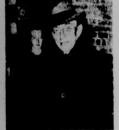
SERGEI RACHMANINOFF, world famous pianist and composer, is shown leaving People's church after his concert Tuesday evening. A large part of the student body was present to hear the well-known artist.