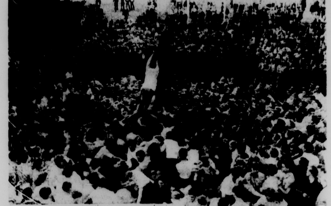
"Down with the Soph flag" is the Frosh cry as they storm the ranks of the second-year men during the "Rivalry to End Rivalry" at the Soph-Frosh field day Wednesday.