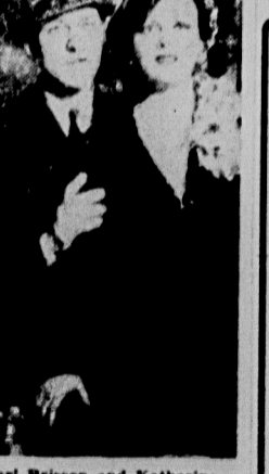
Carl Brisson and Katherine DeMille