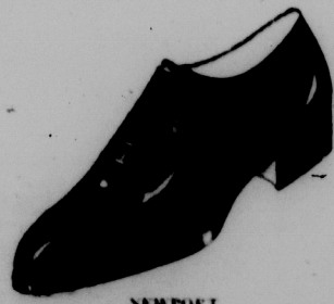
NEWPORT Black Calf Buckler Oxford

A shoe of which you can be proud. It's made of genuine Black Calf, plump and meaty, takes a fine polish, fits your feet perfectly, lends distinction to your fall suit and at the new Walk-OVER price of $6.50 is the greatest value we know.