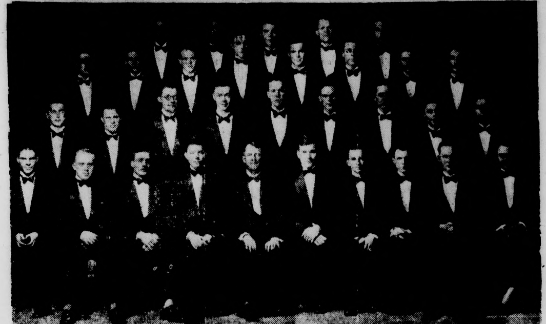
Michigan State college men's glee club which with the women's glee club will present a spring concert Tuesday evening, May 26, at Peoples church are pictured here as follows: (front row seated)...