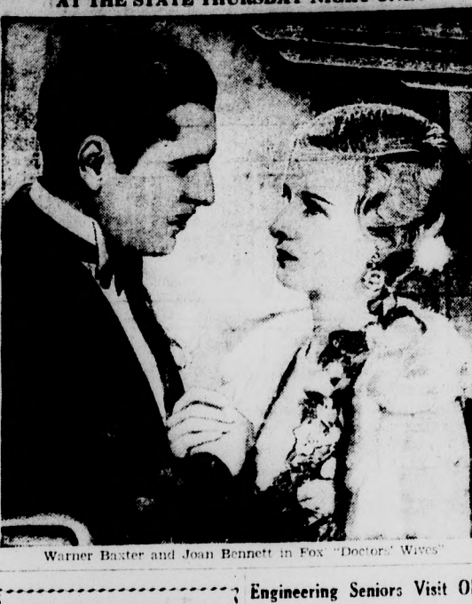
Warner Baxter and Joan Bennett in Fox "Doctors' Wives"