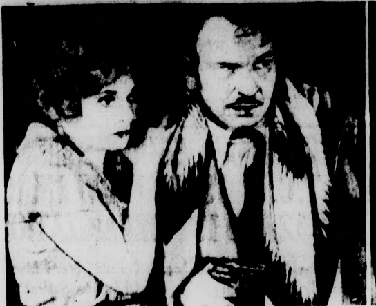
MARJORIE RAMBEAU and WALLACE REID in 'THE SECRET SIX'

Porpoise, Green Splash Unite to Stage Outstanding Exhibition.