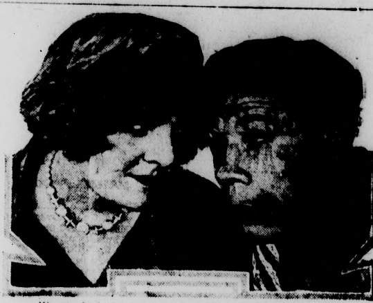
Winnie Lightner and Joe E. Brown in "Hold Everything" A Warner Bros. Production