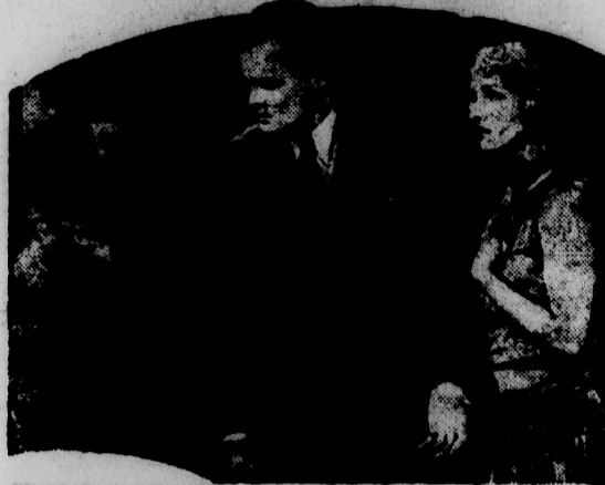
BOLAND, CARROLL, WELLS AND LEILA HYAMS in "THE BISHOP MURDER CASE"