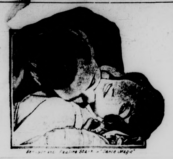
Ben Lyon and Pauline Starke in "Dance Magic"

has been... a bigger... an your... it's easy... you will... to make... include