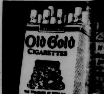
Old Gold CIGARETTES G. P. Lorillard Co., Est. 1790 Made from the heart-leaves of the tobacco plant