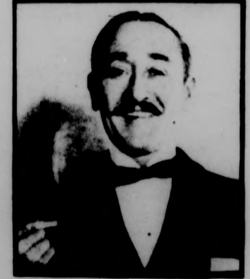
ADOLPHE MENJOU - debonair, sophisticated Paramount star - one of the greatest living actors - appeared recently in "His Tiger Lady", "Night of Mystery" and "Serenade"

The test was conducted by responsible witnesses who asked Mr. Menjou to smoke one of the four leading brands, clearing his taste with coffee between smokes. While the camera recorded the test, only one question was asked: "Which one do you like best?"