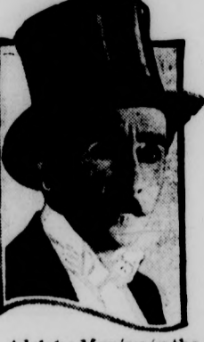
Adolphe Menjou in the Paramount Picture "Serenade"