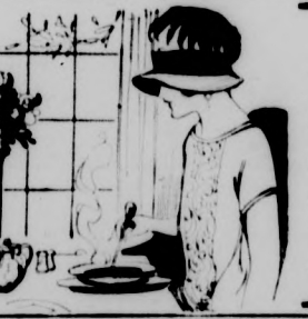
The Hunt Food Shop