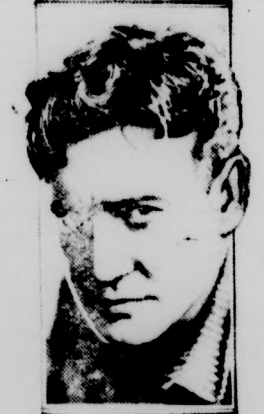
Richard Dix in the Paramount Picture "Shanghai Bound"

At this affair the athletes of the college hold sway and due to this the Varsity party is always much sought after, especially by the J-Hop crowd who wish to enjoy the weekend with a dancing party.