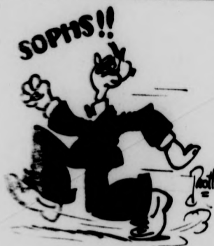
PAINT AND RUN