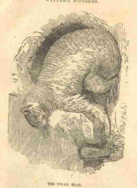
"I think he was called the polar bear; so I suppose he came from the north pole." "He did; and for that very reason wor: