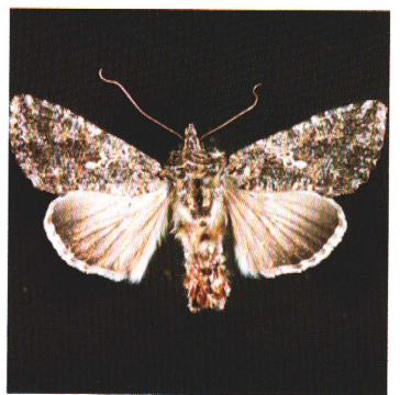
6. Cabbage looper adult