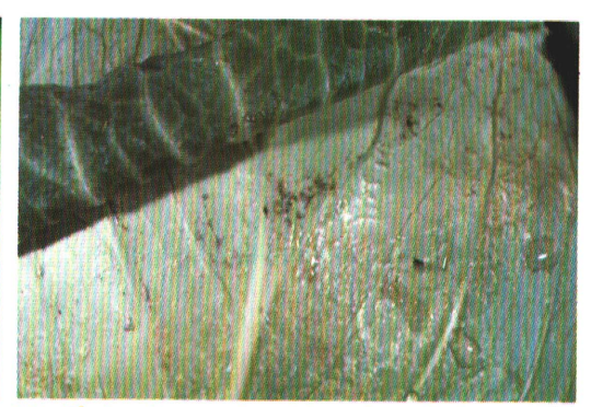
11. Thrips damage to cabbage (speckled brown areas)