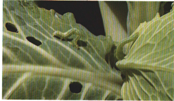
7. Cabbage loopers and damage