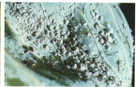
8. Cabbage aphids