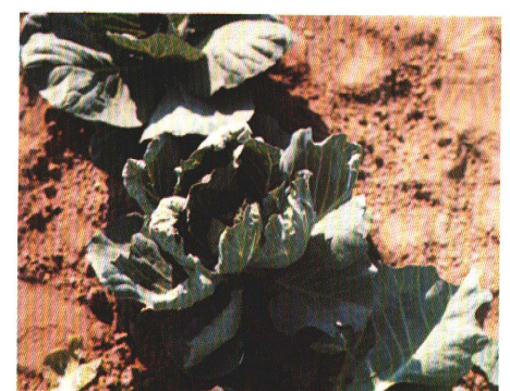
9. Cabbage aphid damage to plant