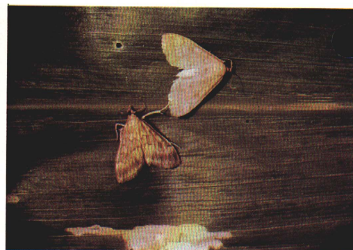
3) European corn borer—adults