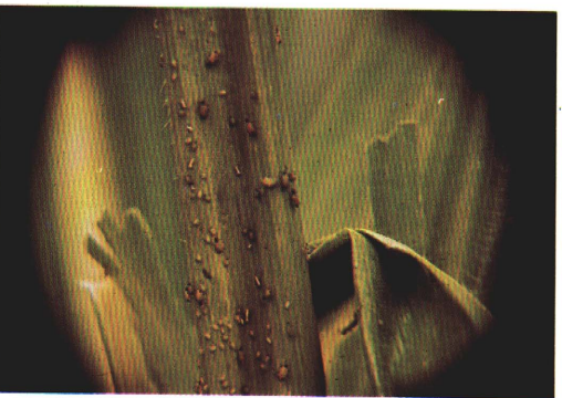
11) Corn leaf aphids