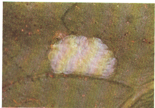
4) European corn borer—egg mass on pepper.