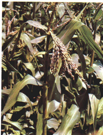
6) Broken tassel due to European corn borer