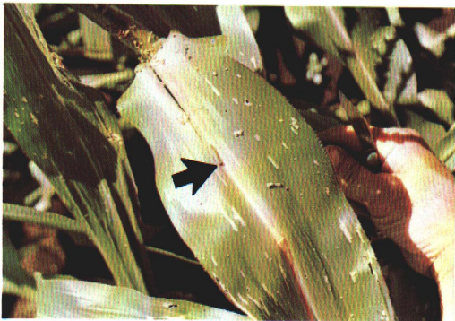
5) European corn borer larva (arrow) and damage to corn leaf