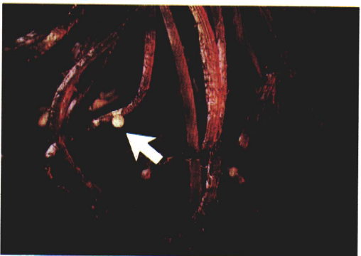
9) Corn earworm—egg (arrow)