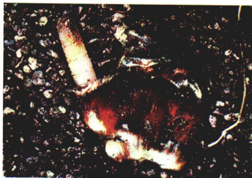
2) Seed corn maggot in corn seed