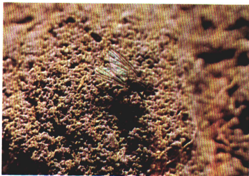
1) Seed corn maggot—adult