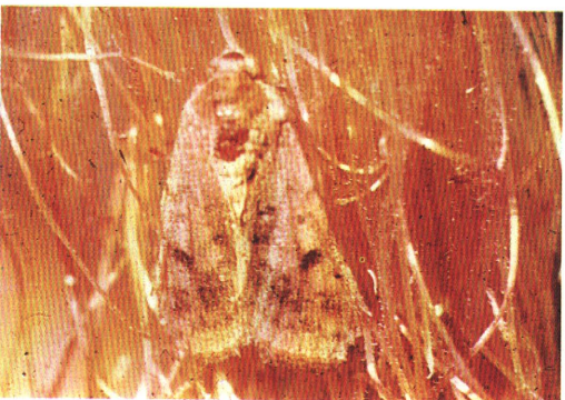
8) Corn earworm—adult