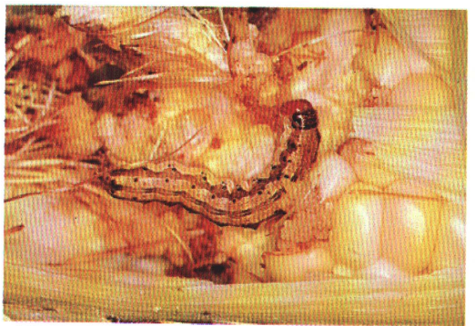
10) Corn earworm—larva