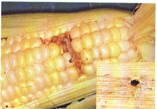
7) European corn borer in ear; entry hole—inset