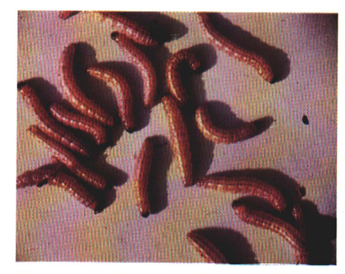
7) Full-grown European corn borer larvae