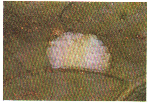
6) European corn borer—egg mass (on pep