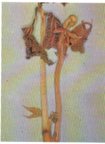
8) European corn borer entry hole (arrow) in bean stem—left; "Flagged" leaves indicate borer in stem—right