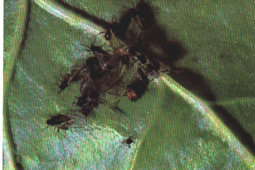
Black bean aphids

10) Mexican bean beetle—adult, left; larvae, right