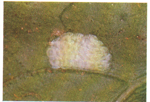
6) European corn borer—egg mass (on pepper)