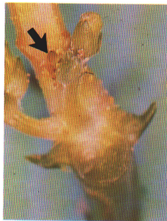
8) European corn borer entry hole (arrow) in bean stem—left; "Flagged" leaves indicate borer in stem—right