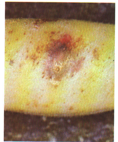
9) European corn borer entry hole in pod