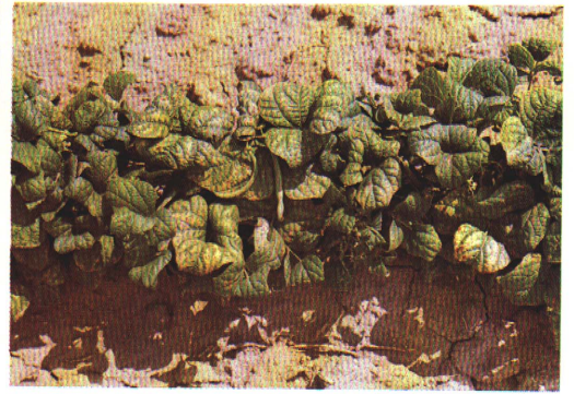
3) "Hopper burn" damage by leafhoppers