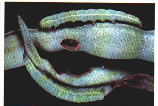
12) Green cloverworm on bean pods