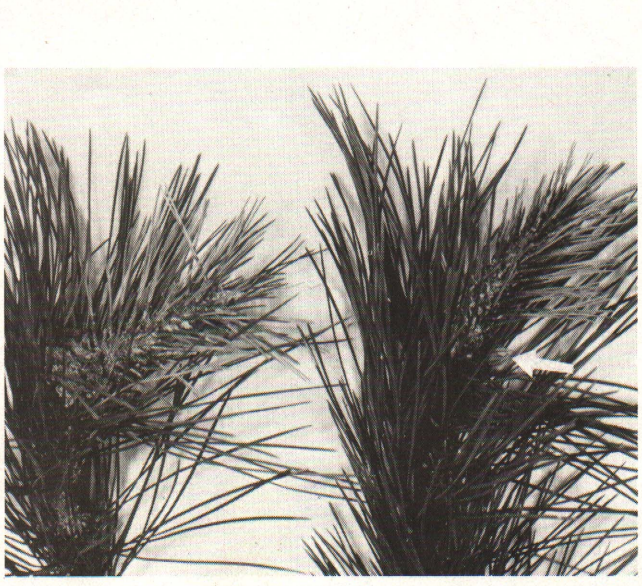
Fig. 1. Diplodia blighted tips of Austrian pine. Needles are usually ¼ to ¾ grown when death occurs. Buds are often initiated at the base of killed shoots (arrow).

disease is arrested when it reaches second-year or mature tissues. However, in instances where the new candles have been killed several years in succession, the affected branch is eventually killed due to lack of new shot growth and normal senescence (death) of old needles. Although rare, seedlings and young saplings may also be affected. Wilting and death of seedlings usually occurs as the fungus girdles the stem at or near the soil line. These attacks usually occur when seedlings have been stressed.