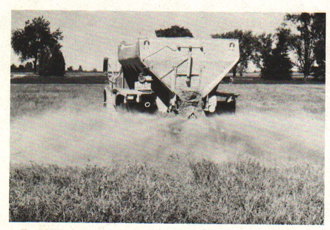
Fig. 2. Adequate lime should be applied, preferably 6 to 12 months before seeding, and incorporated to bring the pH to 6.8 or above.