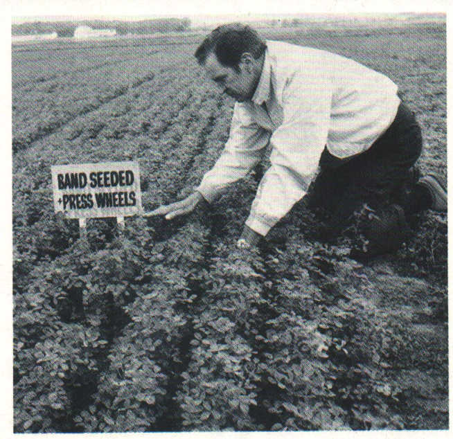
Fig. 1. An excellent stand is necessary for high yields in the seeding year. Twelve pounds per acre, band seeded with press wheels, were used in this seeding.

By M. B. Tesar Department of Crop & Soil Sciences