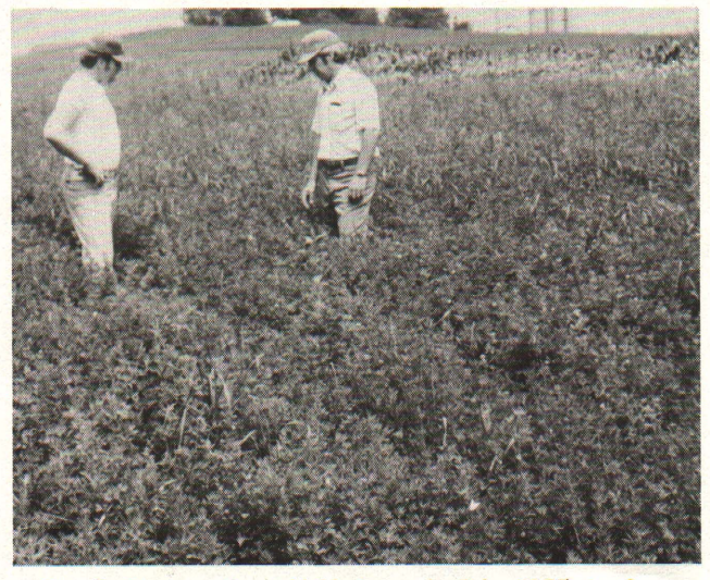
Fig. 5. First cutting alfalfa in early July 1975, in Oceana county yielded two tons hay per acre after a clear seeding made in early May. Eptam was used, preplant, at three pounds active ingredient per acre. The second cutting yielded one ton hay per acre.

[10] Use press wheels on the drill (Fig. 3) or tow a cultipacker (Fig. 4) behind the drill to firm the soil around the seed and cover it shallowly for fast emergence.