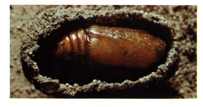
(FIG. 164) Pupae occur between 1\frac{1}{2} to 2 inches (3.8 to 5 cm) below the soil surface, and are enclosed in an easily broken earthen shell. Pupae are brown in color and from 1\frac{1}{3} to 1\frac{1}{2} inches (3.3 to 3.8 cm) in length.

The general body color of the larvae is a light yellowish gray with irregular whitish areas on the top and sides. The whitish areas merge into a distinct white stripe along the sides. The head and body vary in color but are usually light brown and dotted with black spots.