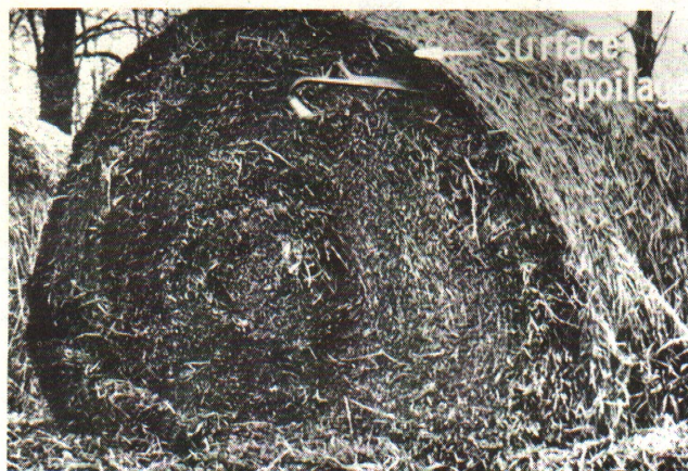
Surface spoilage and heat damage can cause interior deterioration and lower quality forage.

Numerous studies have shown that hay crops decline in digestibility at a rate of 0.3 to 0.5 percentage points per day that harvesting is delayed. Similarly, the pro-