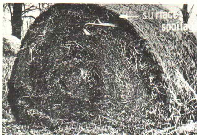
Surface spoilage and heat damage can cause interior deterioration and lower quality forage.

Numerous studies have shown that hay crops decline in digestibility at a rate of 0.3 to 0.5 percentage points per day that harvesting is delayed. Similarly, the pro-