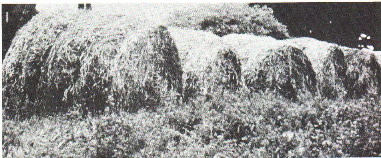
Big Package Hay bales stored outside.

Harvesting forage at higher moisture content reduces dry matter losses. German studies show that dry matter and energy losses of direct cut silage were only 4%; but 7% dry matter and 18% energy loss when harvested as