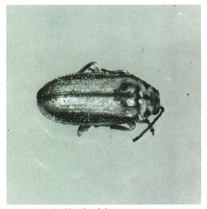
Figure 1. Elm leaf beetle adult.

ADULTS: The adult beetle is approximately 1/4 in. long (6-8 mm) and dull olive-green in color. There is a longitudinal black stripe along the outside edge of each wing cover and an elongate spot at the base of each wing cover near the center of the body.