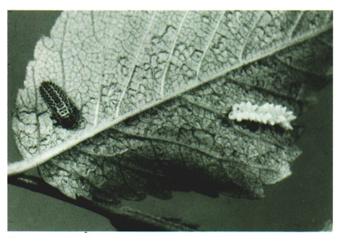
Figure 3. Elm leaf beetle egg mass & larvae on leaf underside. Note feeding damage.