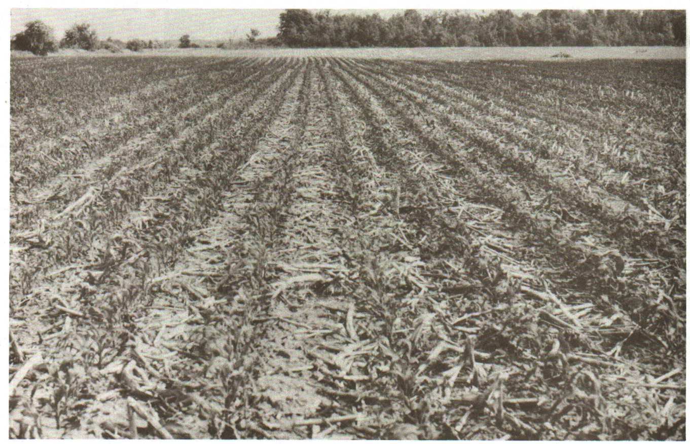
Last year's corn stalks greatly reduce soil erosion. No-till production represents one of the newer and best conservation practices ever devised.

the profile (from 0 for fine clays to 5 for sands) and lower case letters to indicate the natural drainage conditions ("a" for well drained to "c" for poorly drained). The interrelationships and symbols of soil management groups, as related to corn production in Michigan, are shown in Table 1. In this table, the dominant texture of the profile is emphasized—not the texture of the surface soil as in soil type identifications. Thus soil series serve as the basis for groupings.