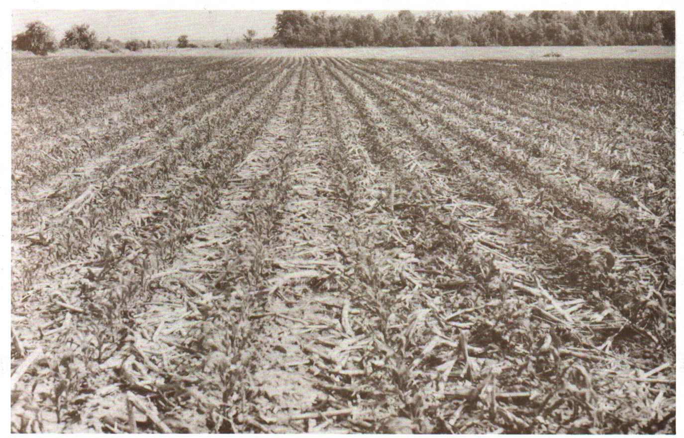
Last year's corn stalks greatly reduce soil erosion. No-till production represents one of the newer and best conservation practices ever devised.

the profile (from 0 for fine clays to 5 for sands) and lower case letters to indicate the natural drainage conditions ("a" for well drained to "c" for poorly drained). The interrelationships and symbols of soil management groups, as related to corn production in Michigan, are shown in Table 1. In this table, the dominant texture of the profile is emphasized—not the texture of the surface soil as in soil type identifications. Thus soil series serve as the basis for groupings.