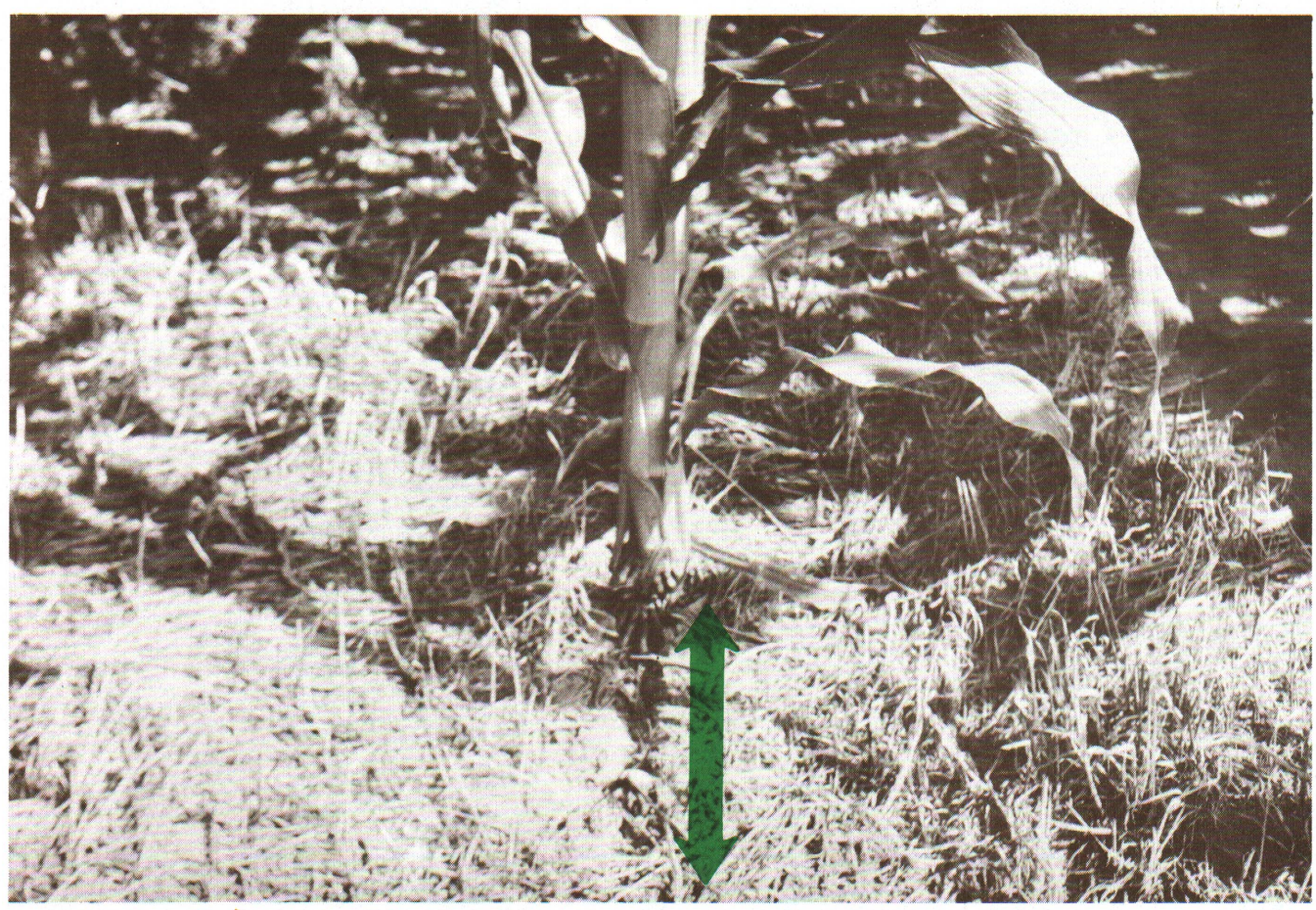
Corn planted no-till in sod. When soil in slot fails to make close contact with seed, germination is slow. In extreme conditions germination percentages may be greatly reduced. Note that corn is missing in slot (at left of arrow).