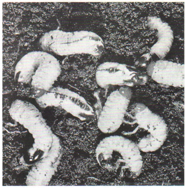
White grubs are the larvae of May or June beetles and feed on the roots of grasses, leaving large, irregular, dead patches. If grubs are suspected, peel back dead sod and look for the grubs, which may be up to 1-inch long.